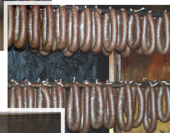
The Smoke Room